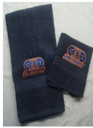
CEI 002 & 003 Navy Towel Sets