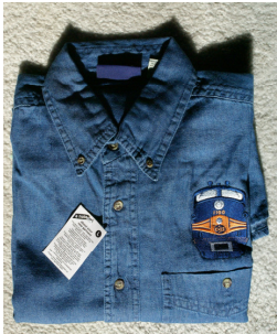
CEI 004 Denim Dk Blue, Long Sleeve