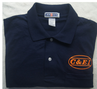
CEI 005 Polo Shirt, Dk Blue Short Sleeve, pocket