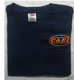
CEI 007 Sweatshirt, Dark Blue