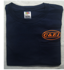
CEI 007 Sweatshirt, Dark Blue