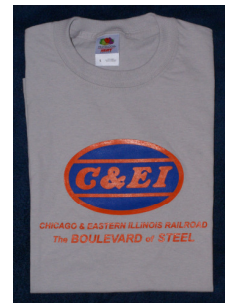
CEI 008 Tee Shirt Silk Screen