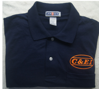
CEI 005 Polo Shirt, Dk Blue Short Sleeve, pocket