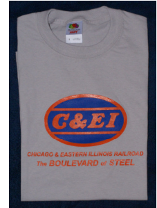
CEI 008 Tee Shirt Silk Screen