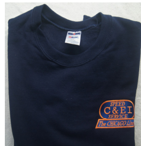
CEI 006 Tee Shirt, Dk Blue Short Sleeve, pocket