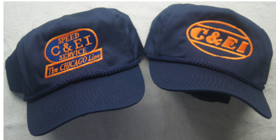
CEI 001 Navy Caps with logo