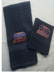
CEI 002 & 003 Navy Towel Sets