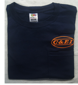
CEI 007 Sweatshirt, Dark Blue