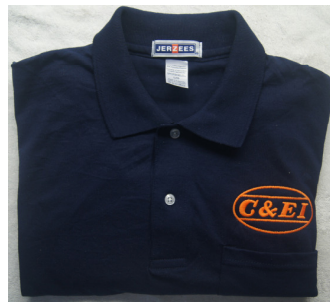
CEI 005 Polo Shirt, Dk Blue Short Sleeve, pocket