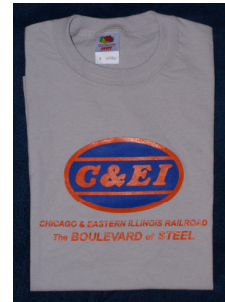
CEI 008 Tee Shirt Silk Screen