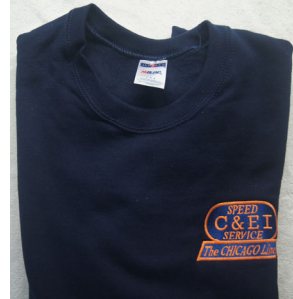
CEI 006 Tee Shirt, Dk Blue Short Sleeve, pocket