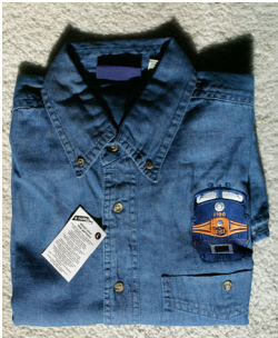
CEI 004 Denim Dk Blue, Long Sleeve