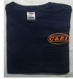
CEI 007 Sweatshirt, Dark Blue