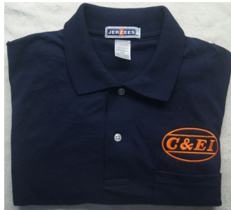
CEI 005 Polo Shirt, Dk Blue Short Sleeve, pocket