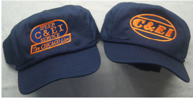
CEI 001 Navy Caps with logo