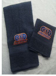
CEI 002 & 003 Navy Towel Sets